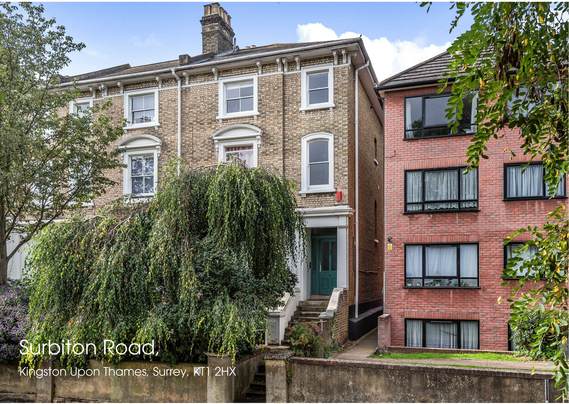
Surbiton Road, Kingston Upon Thames, Surrey, KT1 2HX

34 Richmond Road Kingston upon Thames Surrey KT2 5ED www.gibsonlane.co.uk Tel: 020 8546 5444